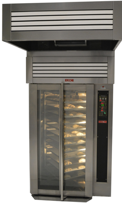
Hood, LMO Max (Oven not included)