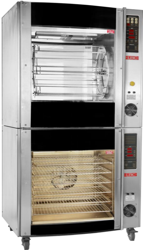
LRC7 Rethermalizer (shown with LCR7 Rotisserie)