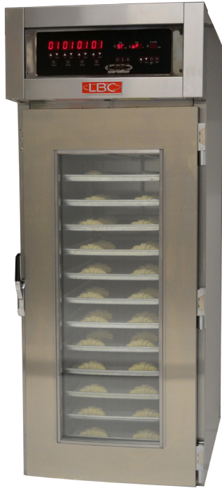
LRP Max-1 (rack not included)