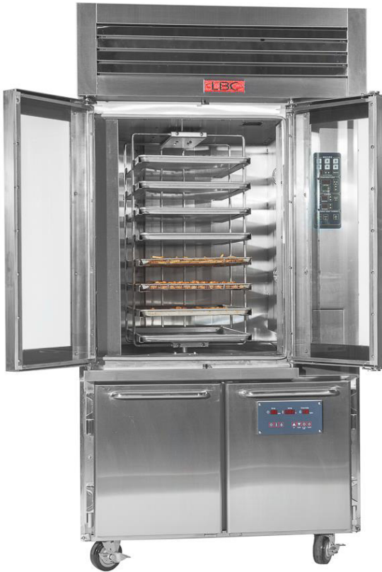
LMO-G (shown with 8-pan rack and LMO-P Proofer Base)