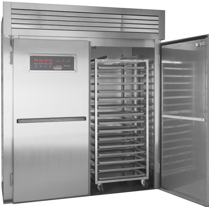
LRP3-130P (rack not included)