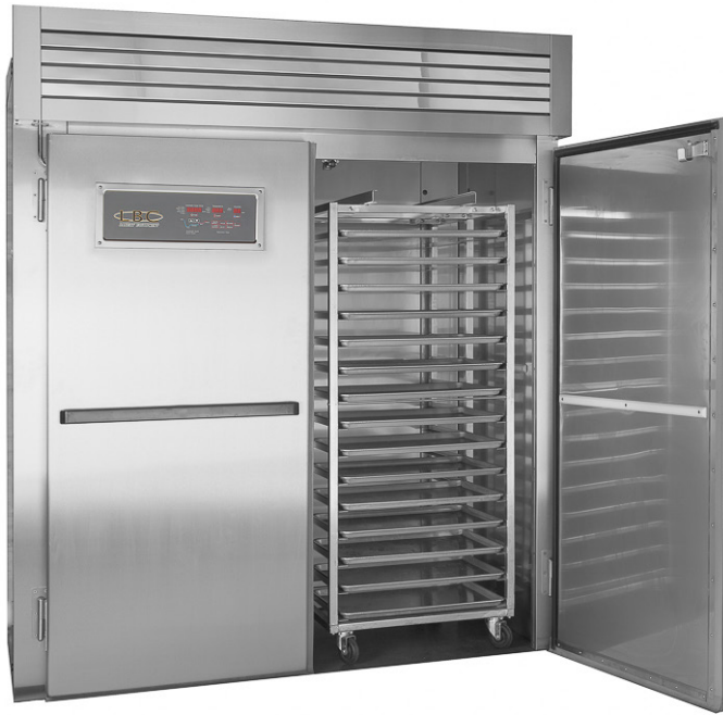
LRPR3-30HO (Rack not included)